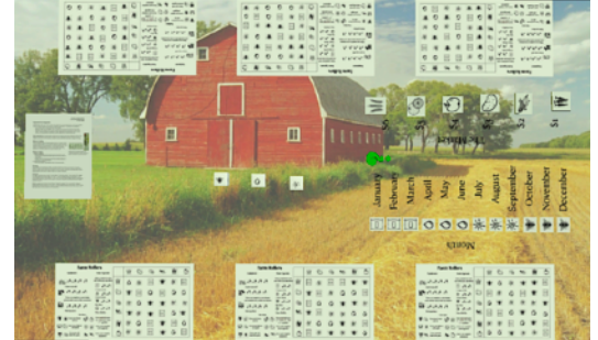
Example: set-up for 6 players in tabletop simulator

Note: there is not a start player since everyone takes their turns at the same time.