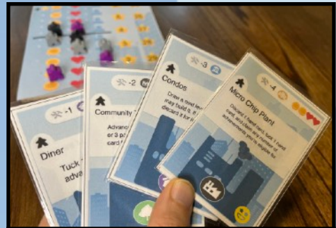
Combo cards for incredible turns