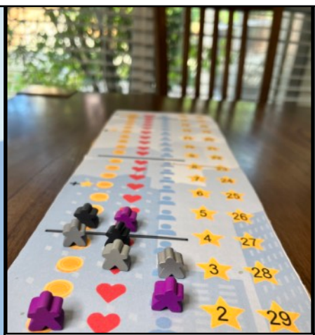
Race up tracks to gain profit, prestige and population