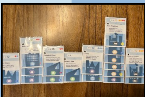
Build cards to form a city skyline

You are each mayors racing to build a thriving, unique city. Build noteworthy landmarks, claim achievements, and race to gain profit, prestige, and population! Paper Skylines is an engine building, worker placement game full of unlimited possibilities.